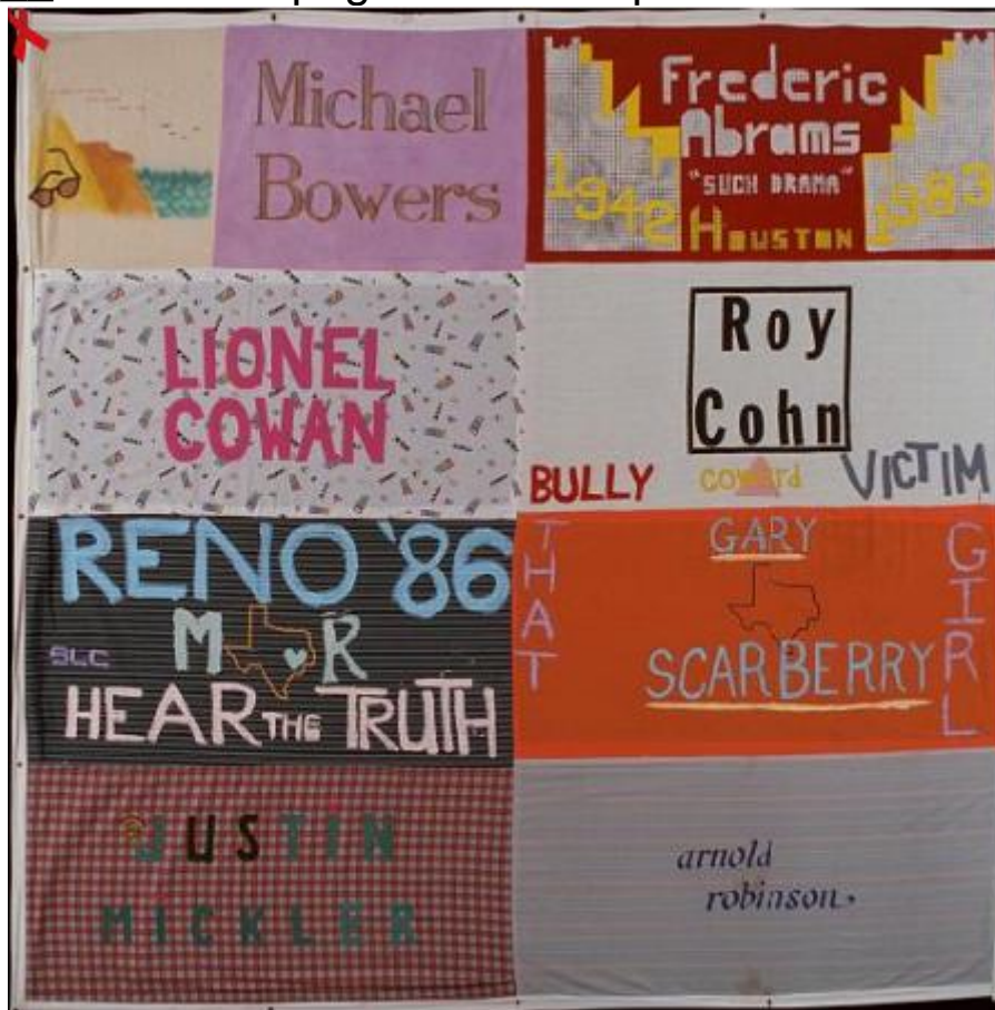
Names on Block # 104

Leader -3: Hello. My name is _____. I am in_(city) _____, _(State)_____. Scroll the page to see the panel names on Block # 104.