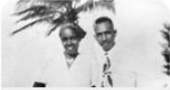
Promising Florida voting rights bill honors little-known civil rights martyrs